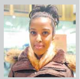
Hyatt First-year, Political Science

"No. I haven't watched any TV lately... but I still wouldn't have watched the show."