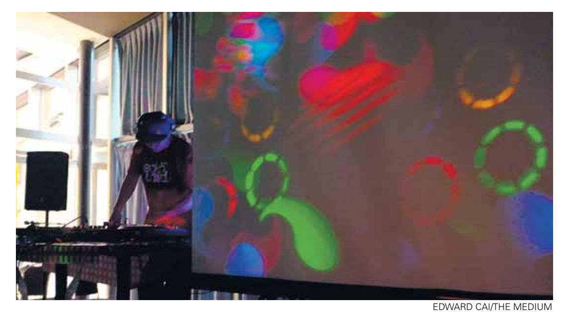
Fist-pump to fundraise for the Italian play.